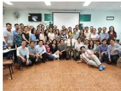
UPNT & UMP Faculty members participated in CEP 2