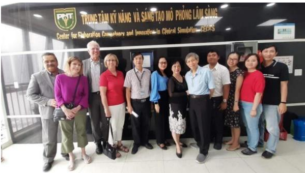
TTUHSC El Paso and CECICS-UPNT members took pictures