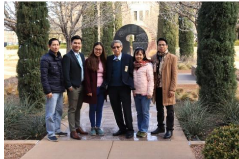
Lecturers of CECICS - UPNT and ATCS - UMP were trained at TTUHSC El Paso