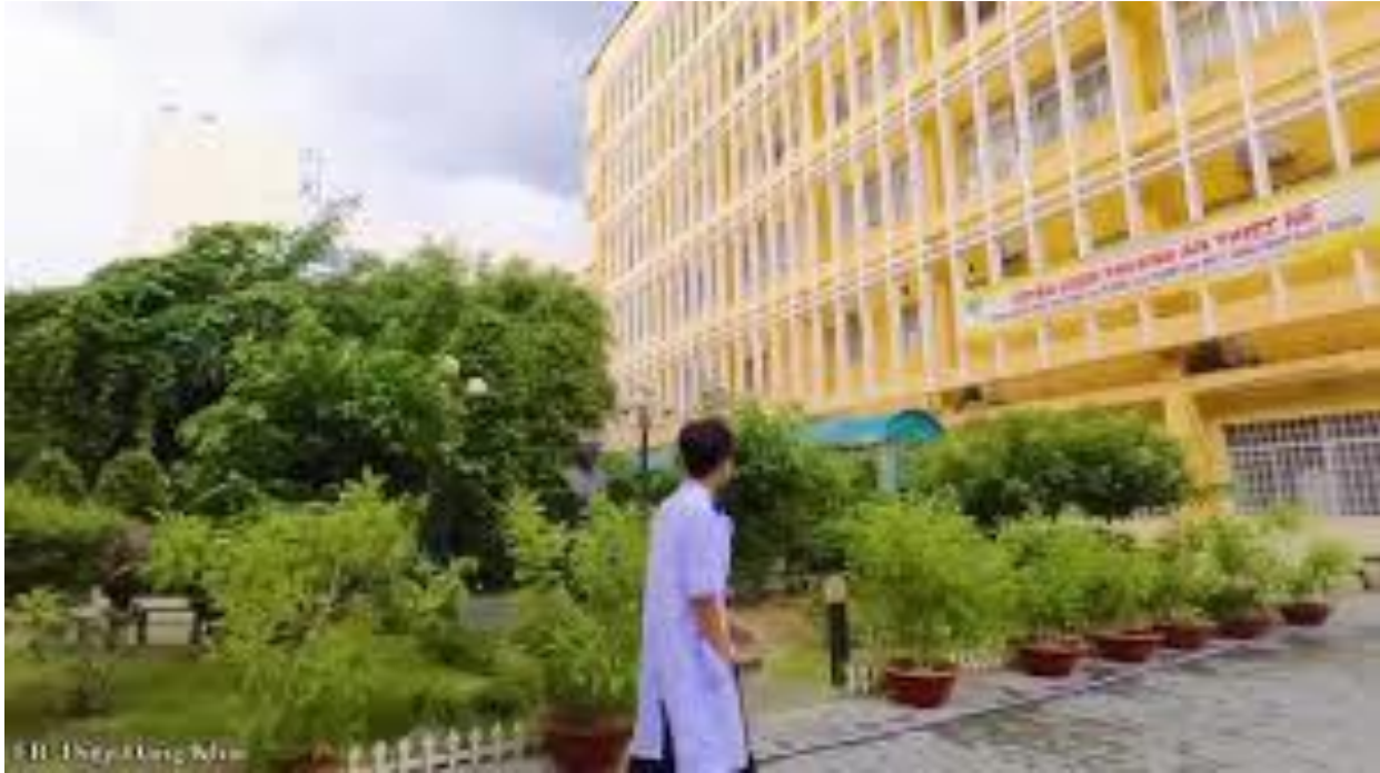
University of Medicine Pham Ngoc Thach