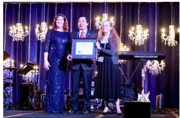
The Rector Board and members of TTUHSC El Paso and UPNT took pictures before receiving SSH Provisional Accreditation in San Antonio on Feb 26 th , 2019