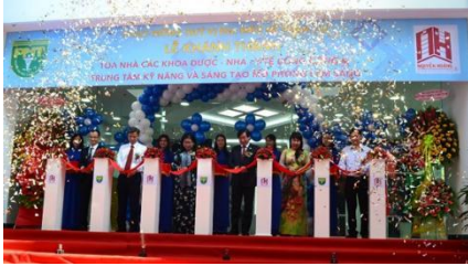
The Delegates cut the ribbon to inaugurate the building