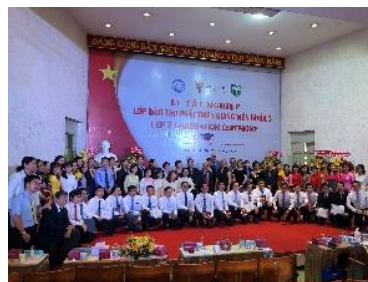
The graduates of CEP 3 (Mar 3 rd , 2020) at UMP