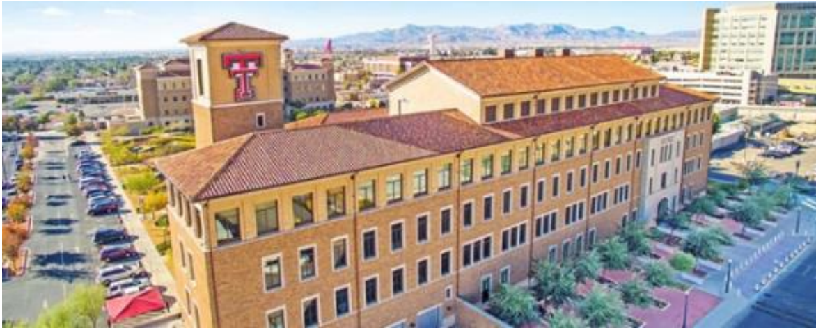
Texas Tech University Health Sciences Center El Paso (TTUHSC El Paso)

Texas Tech University Health Sciences Center El Paso (TTUHSC El Paso) is the only health sciences center along the U.S. - Mexico border. TTUHSC El Paso provides a safe learning environment for students of all levels, which is based on evidence - based medicine and objective assessment, to offer students life-like experiences prior to actual clinical cases.