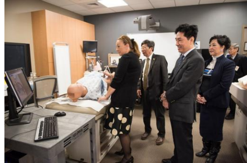
The Rector Board of UPNT and UMP visited ATACS of TTUHSC El Paso