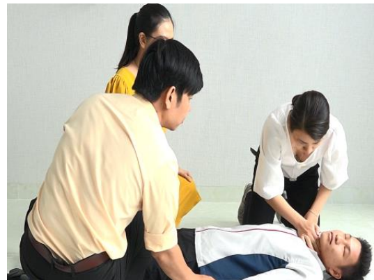
Students practiced on standardized patient