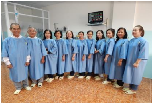
Standardized patients from the beginning days of establishment (2018)