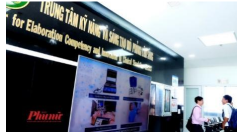
Center for Elaboration Competency and Innovation in Clinical Simulation of UPNT (CECICS – UPNT)