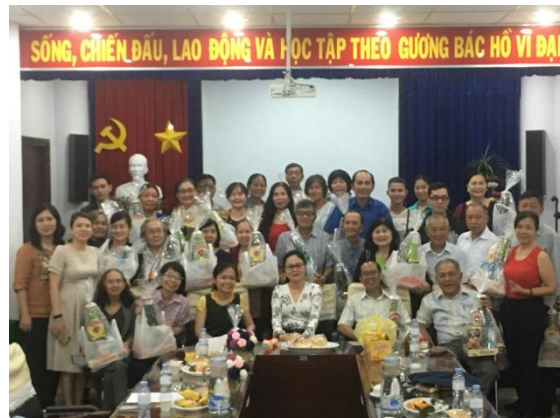
Standardized patients were rewarded for their good performance (2020)