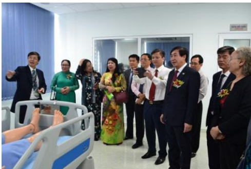
On May 5 th , 2018, the inauguration ceremony of CECICS-UPNT was attended by many HCMC Leaders and Department of Health of HCMC