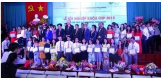
The graduates of CEP 1 (Feb 3 rd , 2018) at UMP